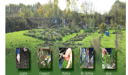
Learn Connect Notice Be Active Give

Join us at Growers Row Shared Garden on the outskirts of Oakham for a pleasant and relaxing, free gardening course.